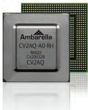
The CV2AQ chip targets automotive sensing camera designs

The CV2AQ's CVflow architecture provides computer vision processing at full 8MP resolution to enable image recognition over long distances and with high accuracy. It includes efficient 4K encoding in both AVC and HEVC video formats, delivering high-resolution video streaming with very low bit rates. The CV2AQ's next-generation image signal processor (ISP) provides outstanding imaging in low-light conditions while high dynamic range (HDR) processing extracts maximum image detail in high-contrast scenes, further enhancing the computer vision capabilities of the chip. It includes a suite of advanced security features to prevent hacking, including secure boot, TrustZone®, and key storage. A complete set of tools is provided to help customers easily port their own neural networks onto the CV2AQ SoC.