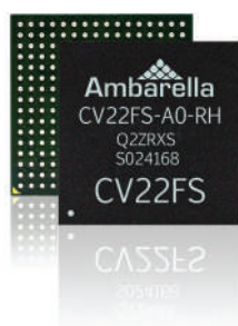
The CV22FS chip targets automotive sensing camera designs

Fabricated in advanced 10 nm process technology, the CV22FS achieves an industry-leading combination of high-performance and low-power for computer vision applications. It is an ideal platform for implementing single- and multi-camera advanced driver assistance systems (ADAS), driver monitoring systems (DMS) and in-cabin solutions, single- and multi-channel eMirrors with blind spot detection (BSD), and intelligent parking assistance systems.